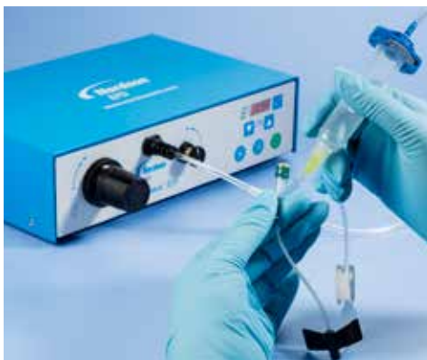
Dispensing a low-viscosity solvent on medical devices.

Nordson EFD's Performus™ X dispensers increase throughput, improve yields, and reduce production costs through controlled application of adhesives, lubricants, and other assembly fluids.