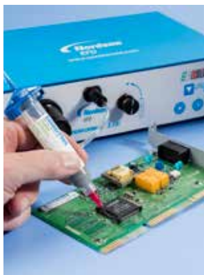
Dispensing SolderPlus® solder paste on PCB boards.