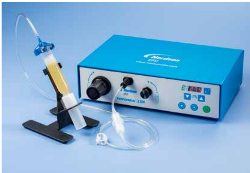
Performus X dispensers provide reliable dispensing for general applications in a wide range of industries.

Reliable benchtop fluid dispensing control for general applications